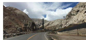
For over 20 years, Red Uniendo Manos Peru accompanied and organized families of La Oroya, Peru in defense of their right to a clean environment and specialized health care in the face of a metals smelter that left the town to be considered one of the five most contaminated places in the world