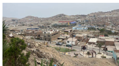
Children in Callao who attend a grade school (light blue building) adjacent to a battery factory and a storage facility for toxic minerals have been shown to have blood lead levels surpassing World Health Organization.

For RUMP the pursuit of abundant life began in the Andean town of La Oroya, known as one of the five most contaminated places in the world due to the toxic emissions from a metallurgical smelter once owned by a U.S. company. In La Oroya 98.6% of children were shown to have levels of lead in their blood far surpassing World Health Organization thresholds. Despite such obvious indicators of generational crisis, violent tension existed in the town about what to do: support the company and its promise of prosperity or, stand in opposition to the company and together with mothers and children in pursuit of life?