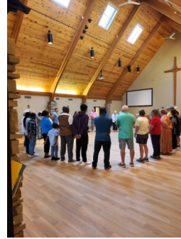
A Sanctuary Blessing